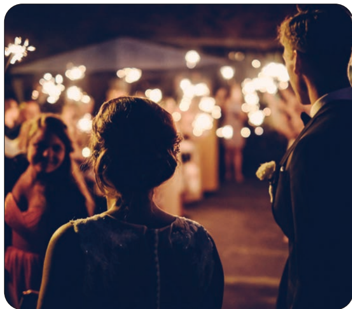
The wedding party celebrated well into the night.

“ Just do it, call the X-Site team to discuss your wedding needs, they will deliver your dream and won't be disappointed! They really understand that it is “your day” and by the end of your experience, they will feel like part of the family. ”